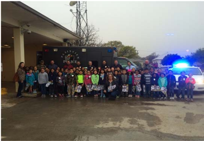
The Police Department had several school tours.