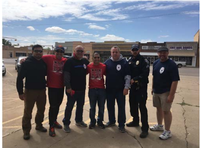
Several police officers participated in the Walk a Mile in Her Shoes program.