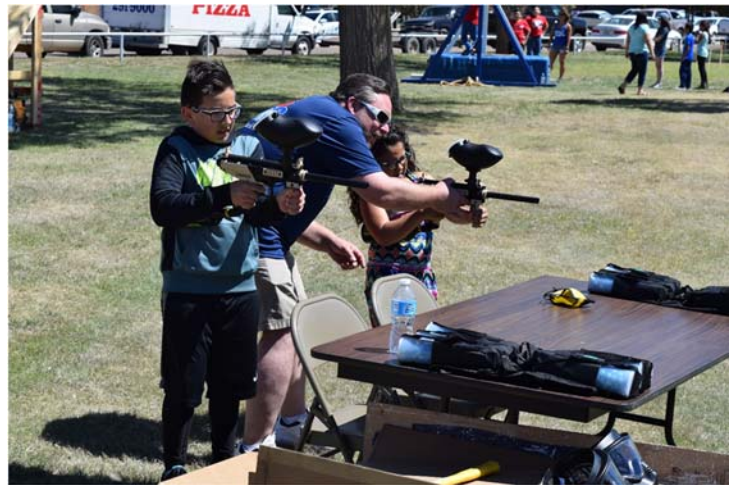
Cops and Kids 2017