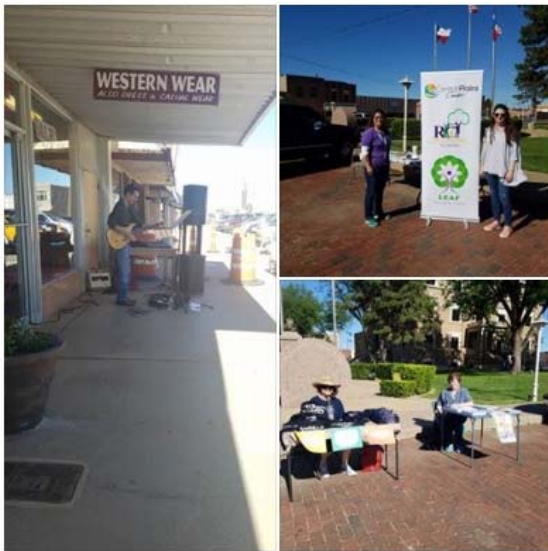
Thanks to all who joined us for the ARTWALK/Wine Walk – a great night to be downtown!