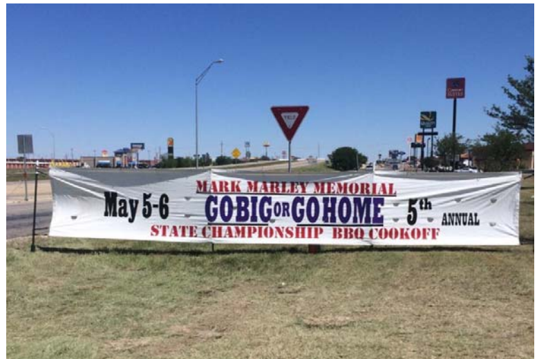
Thanks to everyone who helped with Go BIG – the event was a huge success and included more than 50 teams and 1500 participating, volunteering or enjoying the festivities.